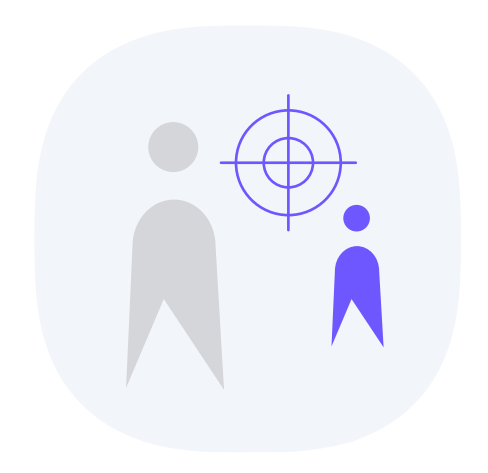
Active shooter incidents