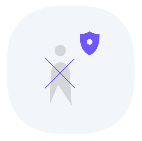
Vehicle & personnel breaching the campus