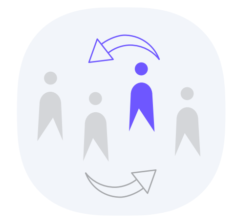
Insights for the campus operations